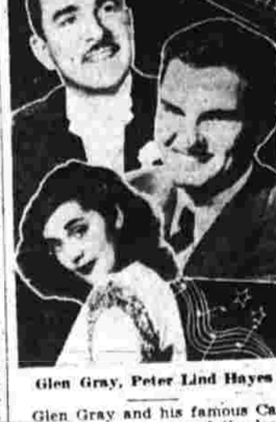
Glen Gray, Peter Lind Hayes