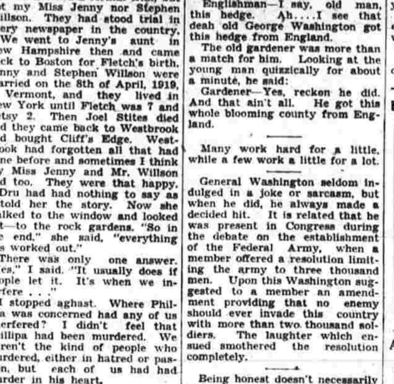
Oh, Happy Day!