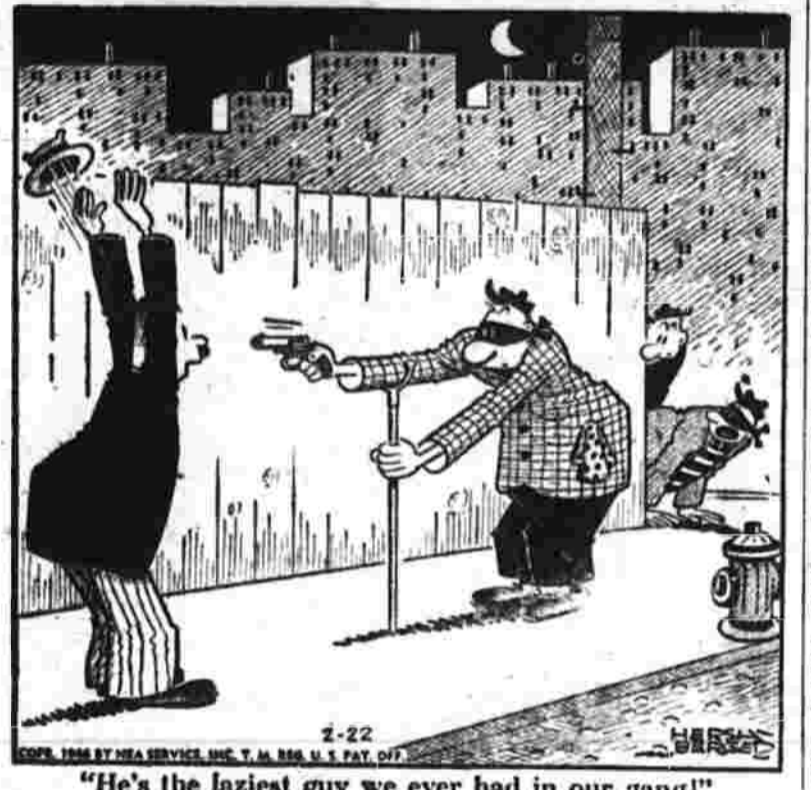
"He's the laziest guy we ever had in our gang!"